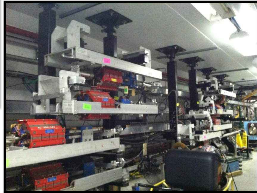
2R Disconnects → magnets removal 6/21