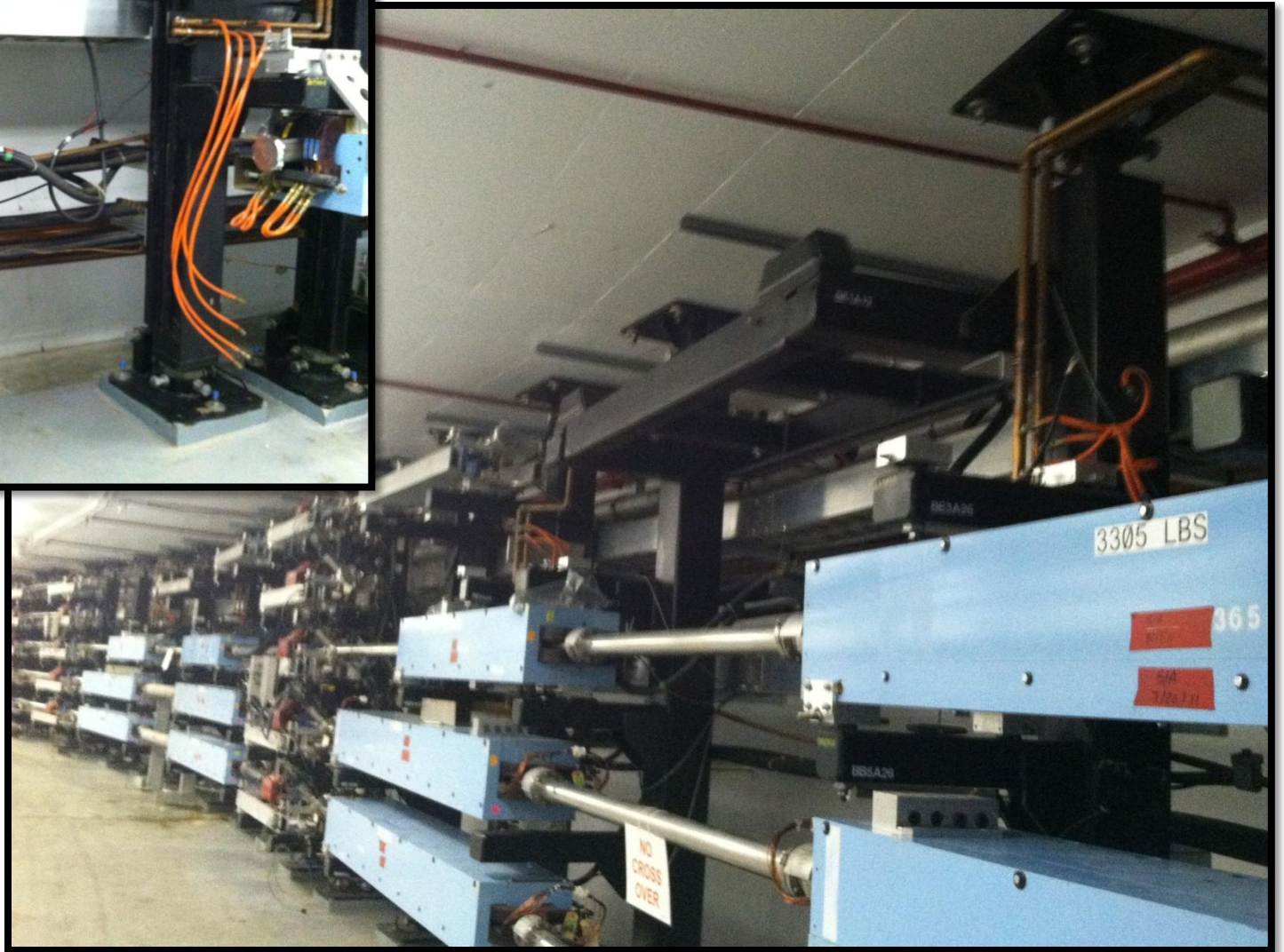
East Arc – 1 st and 3 rd pass magnet removal