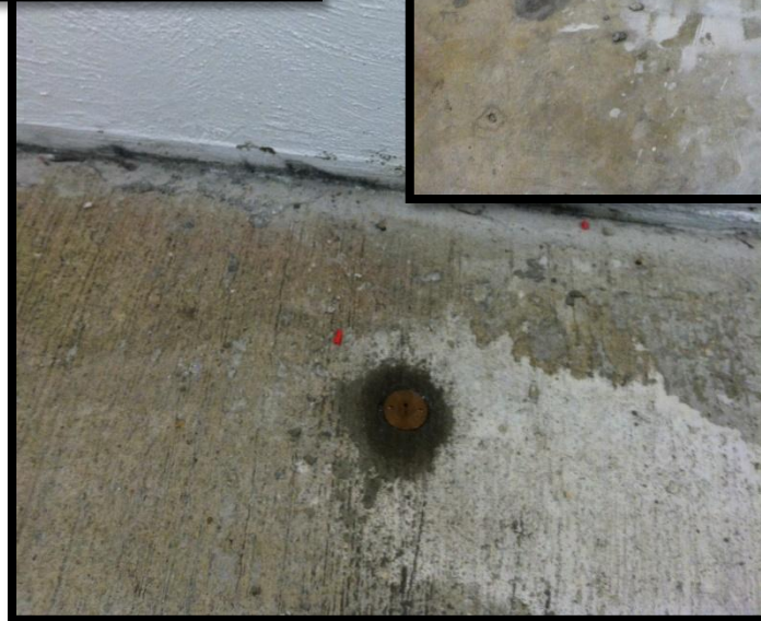
S&A Monuments in Hall D Line to Tagger Area Installed