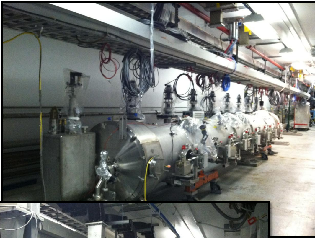
C100 -3 parked @ 1L24