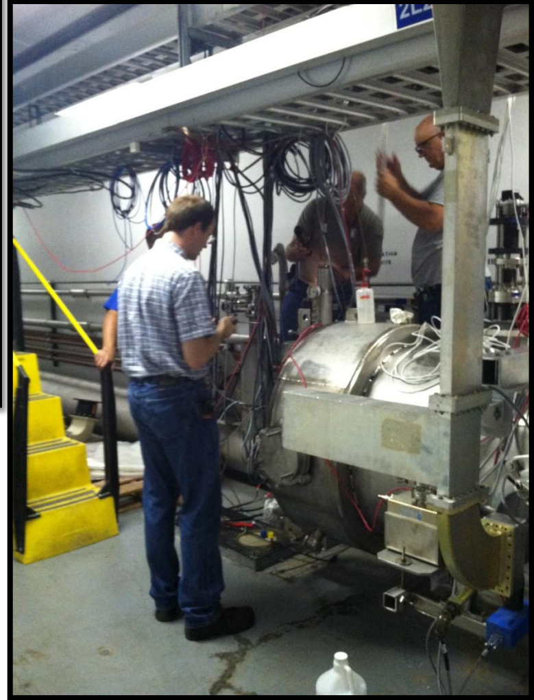
2L22 JT Valve Repair