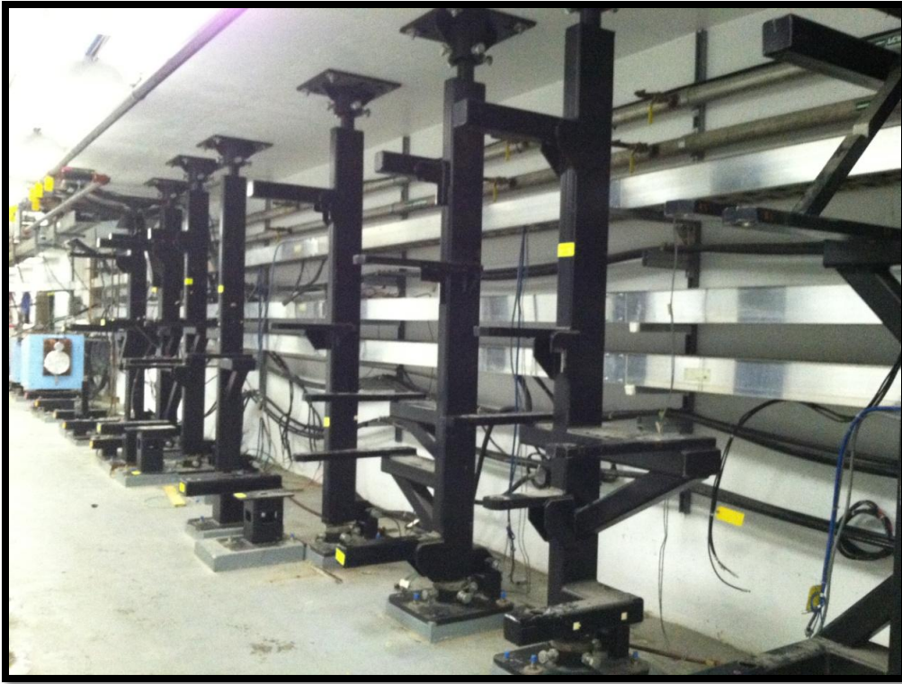
2S Ready for Stand Removal